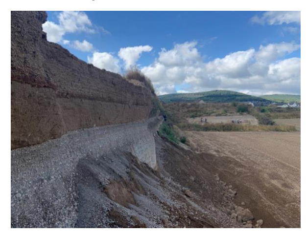
Laacher See eruption, proximal-medial fall deposits, Picture credit: Ulrich Kueppers