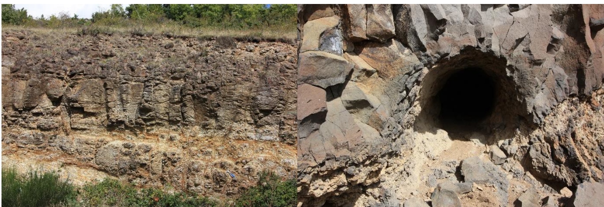
Day 3. Basanitic lava flows from the effusive activity predating the main phases of the stratovolcano, including spheroidal weathering lowermost flow in contact with ologocene sands on the left, and a tree mold at the base of one of the upper flows on the right.