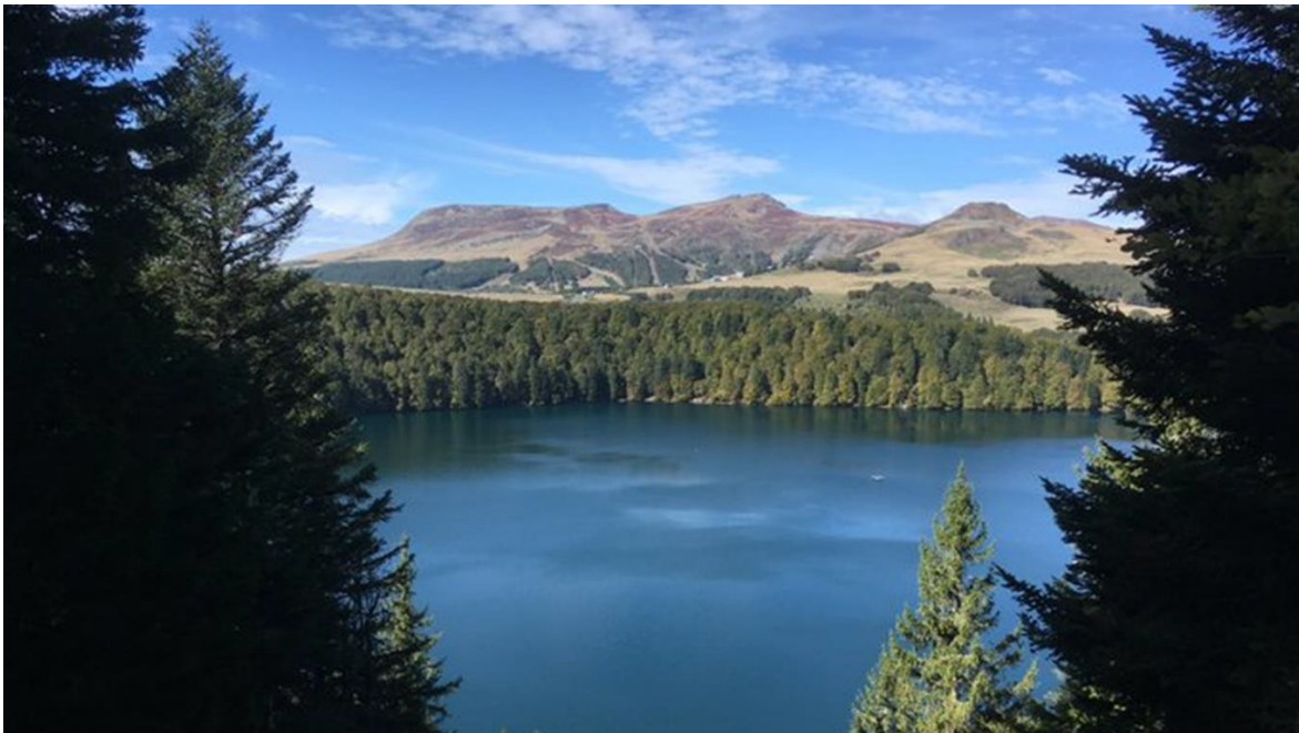
Day 5. Lac Pavin, the youngest volcano in mainland France (a maar) erupted 6700 years ago.