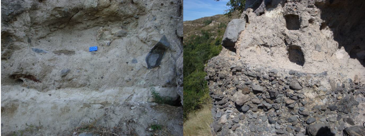
Day 4. Alternance of fall deposits, lahar and debris avalanche deposits and streambed sediments in the distal deposits at Perrier.