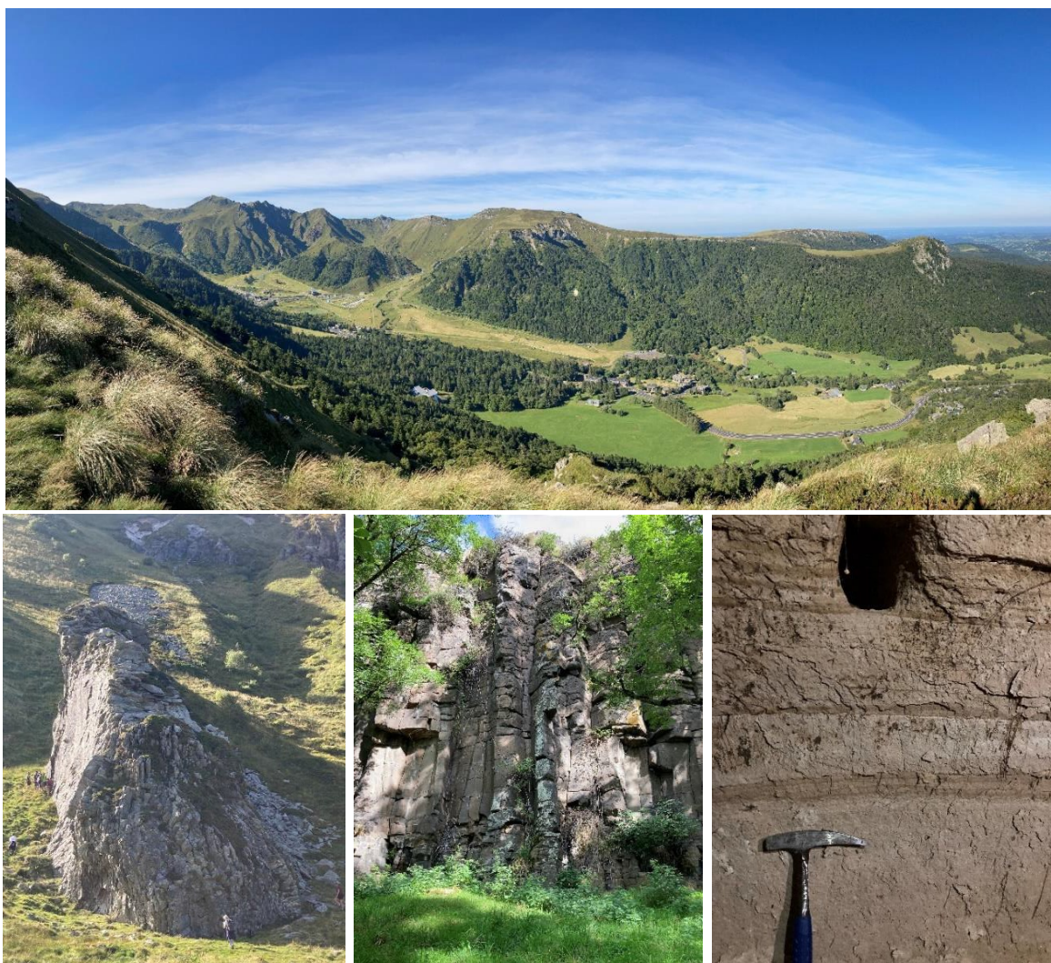
The summit of the Monts Dore stratovolcano viewed from the North and up the glacier-cut valley of the Dore which exposes so much of the interior of the edifice. Below, left, the dyke of the “Verrou” exposed in the heart of the edifice. Below, middle, thick columnar-jointed lava flows at Laval: witnesses of the opening phase of activity. Below, right, structures within an ignimbrite exposed in a St. Nectaire cheese cellar.

Summary: The Monts Dore volcanic complex comprises two deeply eroded stratovolcanoes: Guéry, active 3.1–1.5 Ma and Sancy, active 1.1–0.2 Ma. Glacial and fluvial erosion of the edifices has exposed a remarkable sequence and variety of deposits. Proximally, these include thick silicic lava flows, domes, lava lakes, hydrothermal systems, dykes, phreatomagmatic deposits, and block-and-ash flows. Distally, there are superb case type examples of ignimbrite and debris avalanche deposits, extending out to 40 km from the source. We also can witness the interaction of lava flow and paleotopography in the opening phase of construction of the stratovolcano, where deposits can be seen in direct contact with the basement. Renewed activity produced the youngest volcanoes of the Western European volcanic province, including Lake Pavin (6700 years). The site is also one of the best cheese production centres of France: that of St. Nectaire (DOC). This will be also sampled, along with fine wine to match the food as selected by one of the best “cavists” in France.