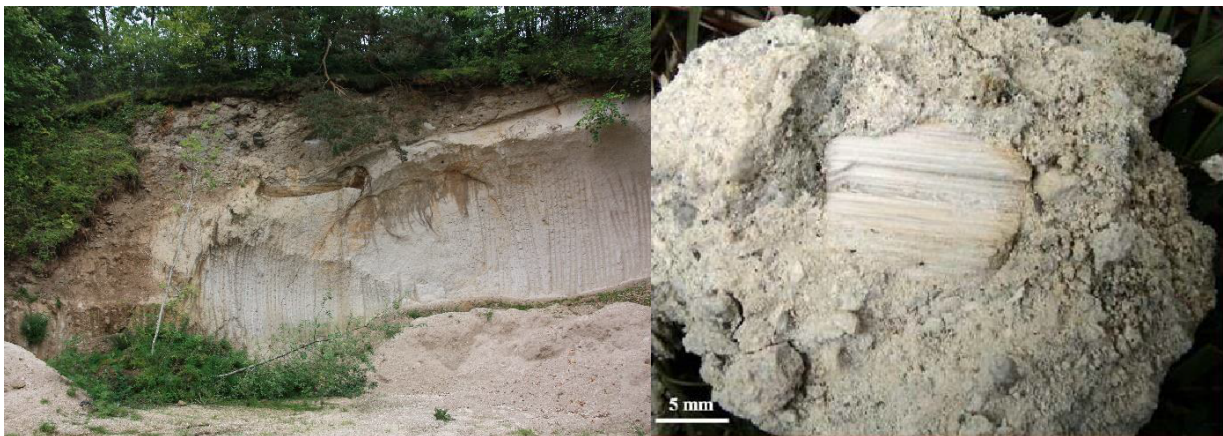
Day 2. Outcrop and hand sample of the main ignimbrite deposit – the “Grande Nappe de Ponces”.